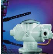
GC31 - GC34 Series