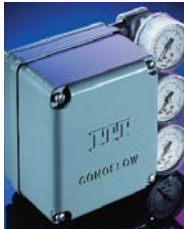
GP50 / GP51 / GP52 Series