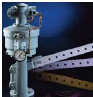
GB52S / GB53S Series