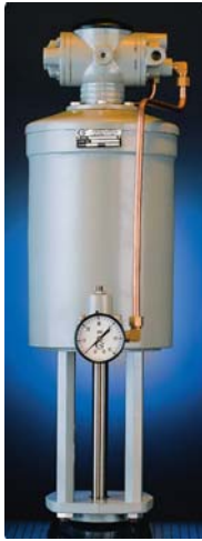
GB50 - GB55 Series