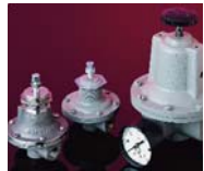
GH20 / GH40 Series