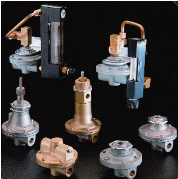
GDH Purge Assembly