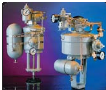
Fail Safe System