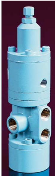
GVB11 / GVB12 Series