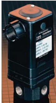
GT210/GT410/ GT610 Series