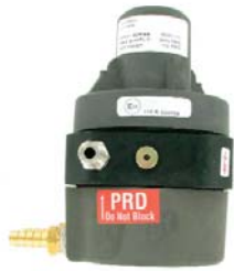
High Pressure - Natural Gas Regulator